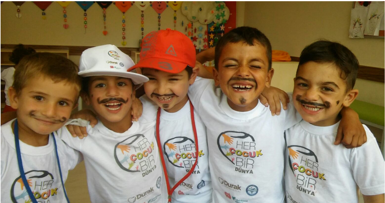
On a certified hazelnut farm in Turkey, summer school is provided for the children of seasonal workers.

stronger commitments, tailored risk assessment and mitigation measures, enhanced monitoring and remediation strategies.